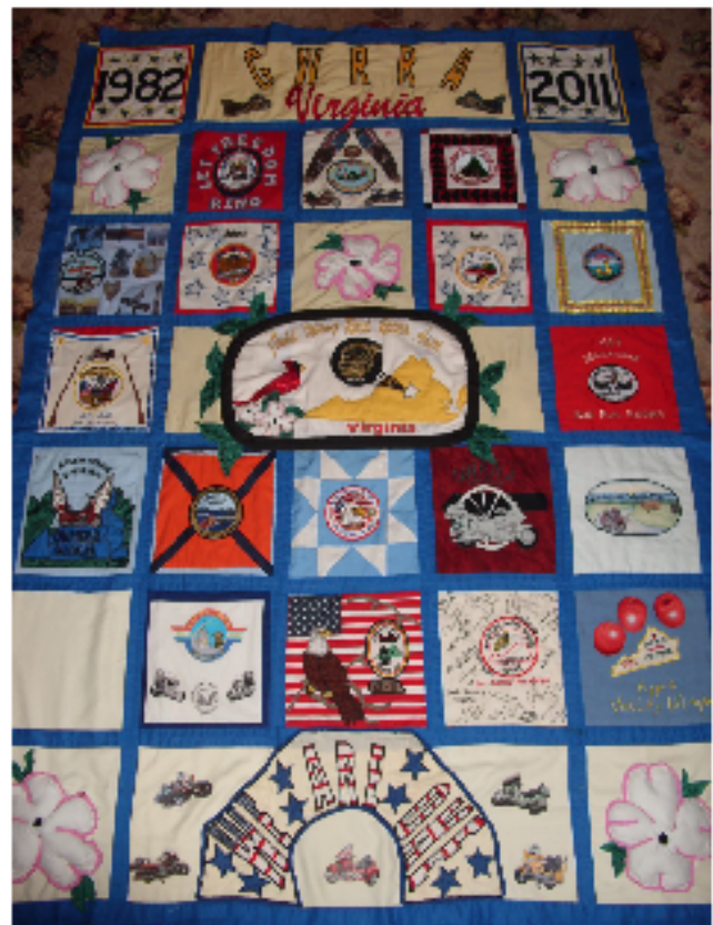
Photo of an actual quilt that was constructed for, and awarded at the 2011 Virginia Convention

Your Region Team Friends for Fun, Safety & Knowledge