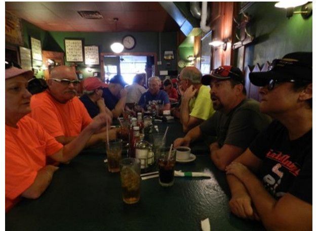
Post Blast dinner at Miguel's