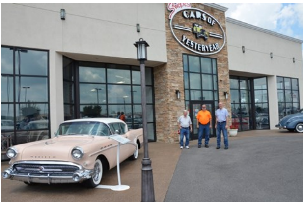
Trip to E-town for the Cars of Yesteryear Museum