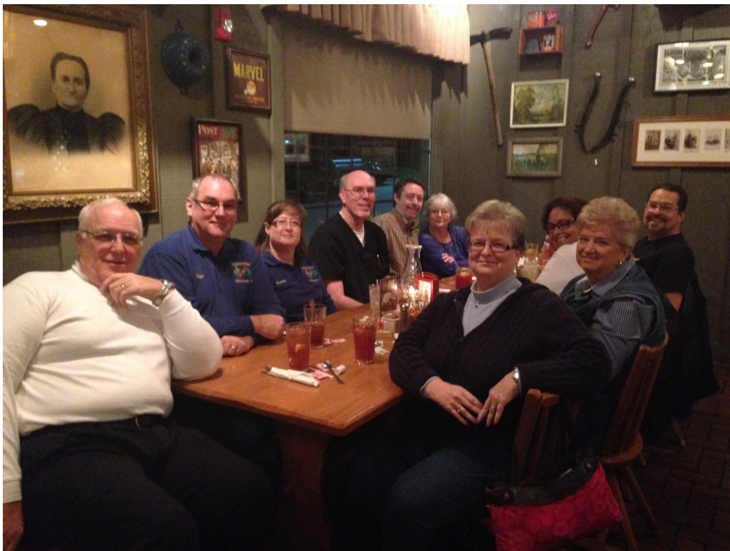
Cracker Barrel November 2013!