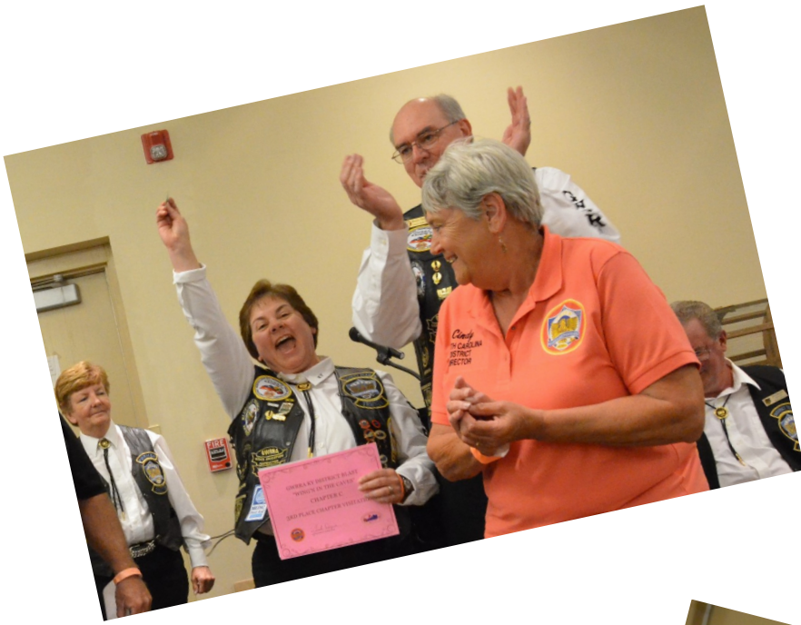
Chapter C wins the Traveling Plaque at the 2016 Blast