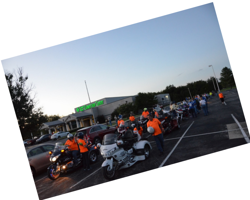
Line up for the Light Parade