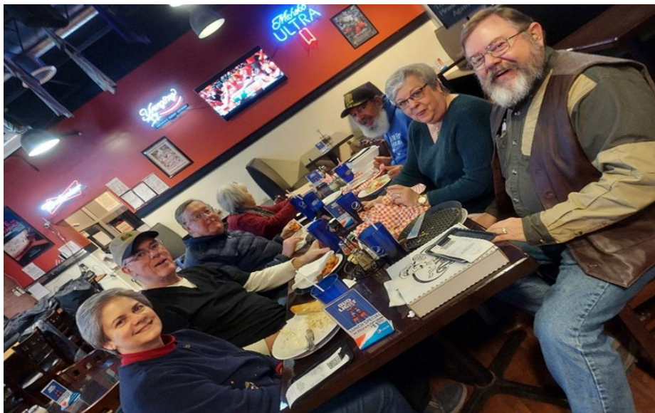
Dinner at DaVinci's with great friends and great food!

Catching a yellow jacket in your shirt at 70 mph can double your vocabulary!