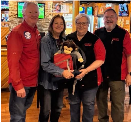
Chapter K brought home both of the Mascots. Let the journeys continue !