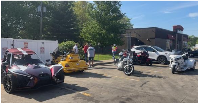
On April 12 th 10 members rode to Porgie's Chow Wagon in Rough River on one two wheeler, three trikes, one Slingshot and one cage.

The lunch was great as we were joined by five members of Chapter A, what a splendid group! The weather was perfect and the roads were good.