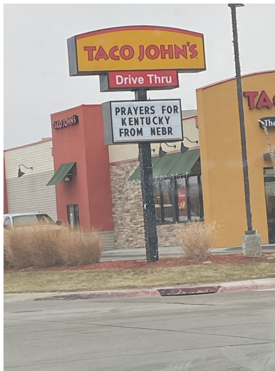
A picture from the NE/SD GWRRA Dist. Director