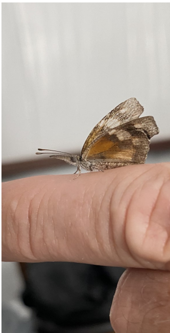
"snot nosed" butterfly

One day we decided to ride to Cooper's Pit Bar-B-Que in Llano. That's about a 2 hour ride, each way, but we were ready to ride the Hill Country and Cooper's was a good destination. Currently, much of the Hill Country is experiencing a snout nosed butterfly migration. As a result, our bikes were plastered with butterflies, that I started calling "snot nosed" butterflies, based on what my windshield looked like.