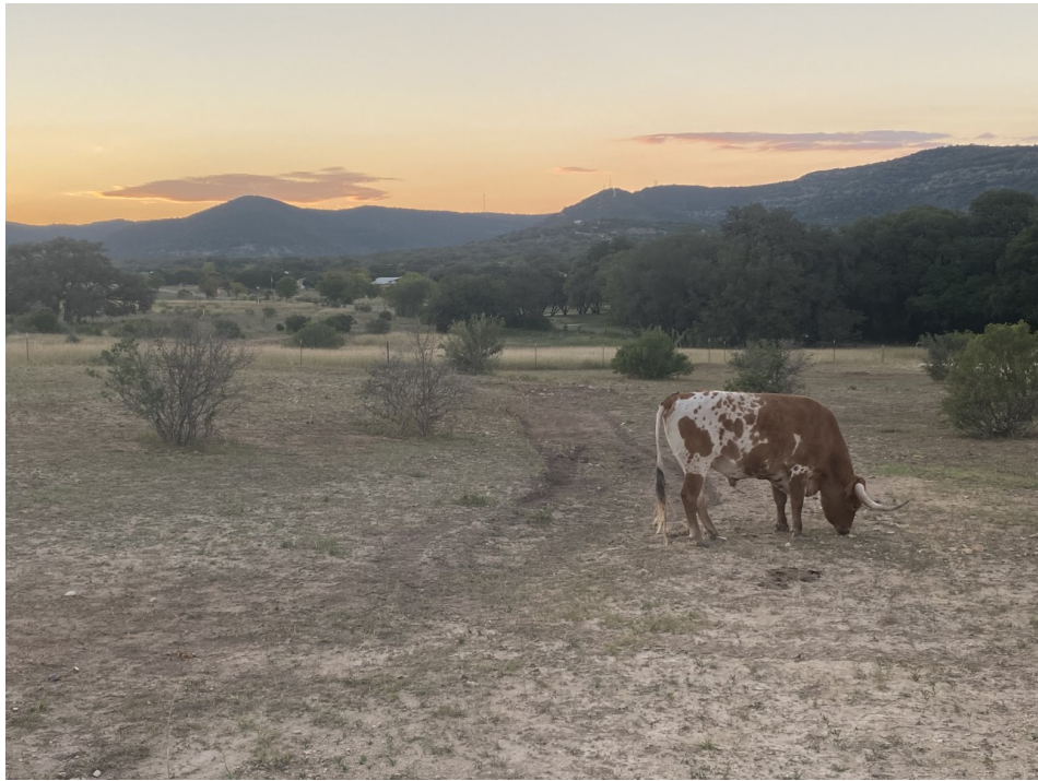
Sunset in the Texas Hill Country