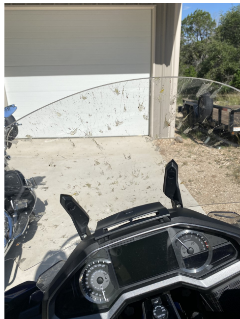
What a mess!