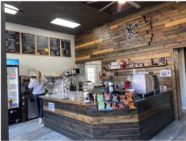
Blackjacks where I had pizza Monday night and a latte the next morning.