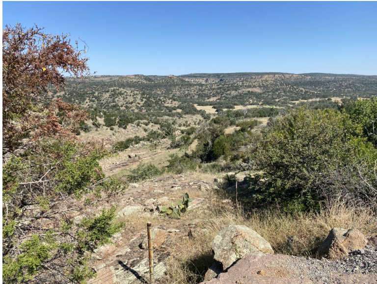
Willow City Loop Road

But we saw some neat scenery like the hills along the Willow City Loop road. I had been on this loop before one spring when the Texas bluebonnets were blooming. It looked much different in the fall but still interesting country.