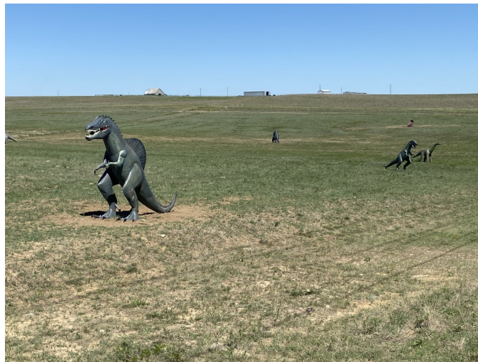
Field of Dinosaurs

Monday morning was, again, a comfortable 58 degrees as I rolled out at 8am. My destination would be Dublin, TX, southwest of Dallas. I rode 418 miles that day. On the road I came over a hill and something caught my eye.