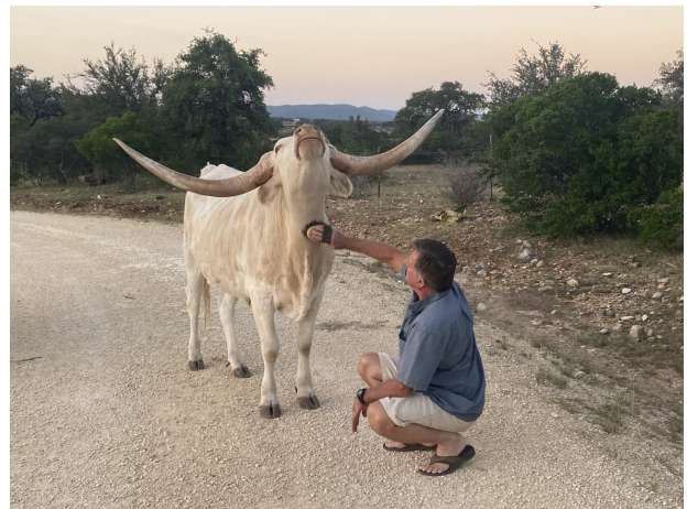
And Lefty needs his evening brushing

I left Scott's 40 acre "ranch" on Sunday, October 2 at 8am in 53 degree temperatures. And 512 miles later I arrived at my motel in New Boston, TX just west of Texarkana. I hit the road the next morning around 7:15am, again, with 53 degrees on the thermometer and pulled in to my driveway at 4:15pm after a 522 mile day.