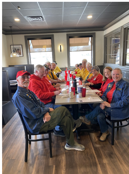
Lunch with Chapter K at Majestic in Princeton 3-5-22

We had a chance to catch up with Chapter K eating lunch in Princeton on one of their rides. It was nice to meet these folks and we look forward to getting together with them again. "You meet the nicest people on a Honda."