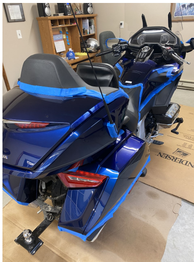
Taped up and ready to start

Often thru this whole detailing process I would spray the bike down with a 10% alcohol solution and wipe it down to insure the surfaces were clean. Next, I taped the black areas on the bike with painter's tape to try to keep the creams off during the power buffer operation.