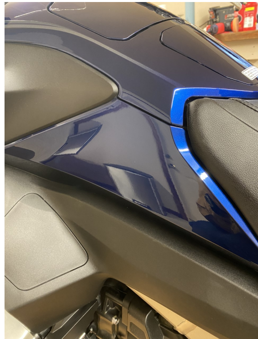
Tank area where my knees had dulled the paint buffed out completely!