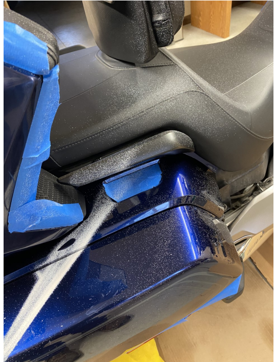
Note: don't lift the polisher with it running! Makes a MESS.