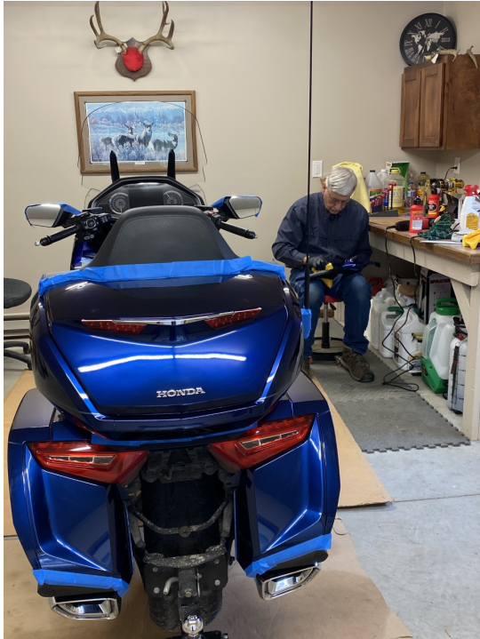
Working on a side cover