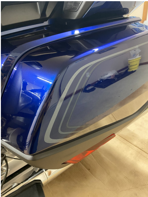
Ceramic coating is hard and looks great!