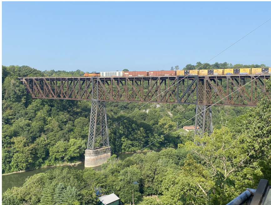
It's hard to judge how high this bridge is until a train passes over it.