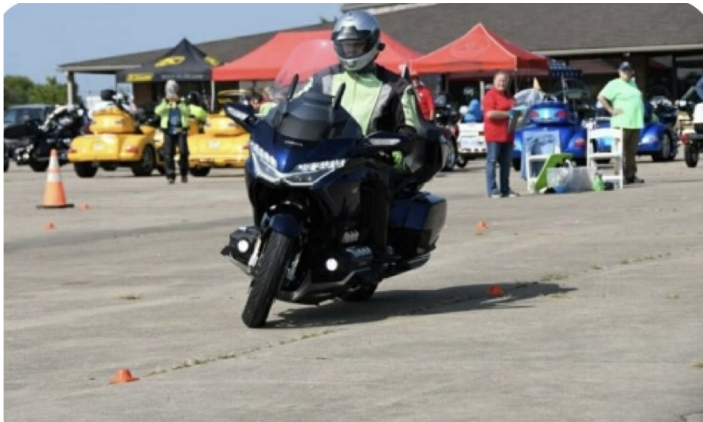
Taking my Wing thru the slalom race.

The 2024 Blast will, again, be in Danville and that's fine with me. We haven't worn out this location yet. There was good food, good evening entertainment, good riding, good friends and lots of fun. It was a BLAST.