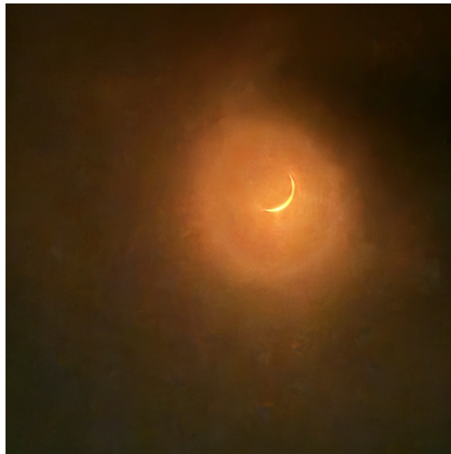
The April 8 total eclipse thru the Texas clouds.