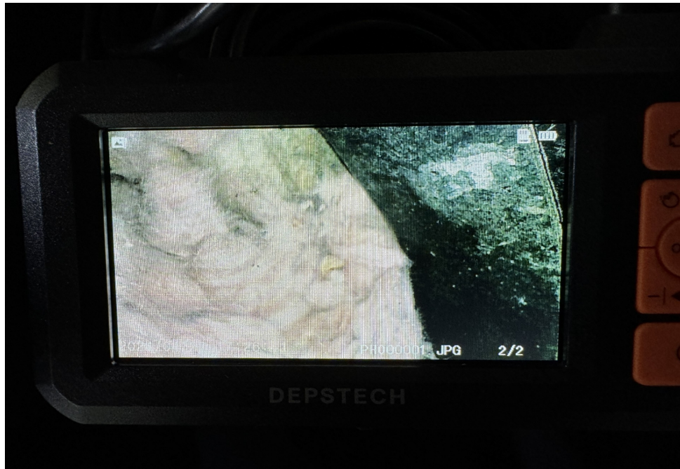
Pink fiberglass insulation! And it is densely packed on top of my filter.

one. The business end of the cable has a tiny camera on the tip and a second one on the side with LED lights. How cool is that! So let's see if that mouse has built a nest in the bike. I poked the scope in every hole, crack and opening of every kind and felt relieved that there was no nest to be found. But I had recently watched a YouTube video of a guy using one to actually look inside the air intake and view his air filter. So, after re-watching the video and getting the exact angle to insert the camera, I worked my way in to the air intake and got this view of my air filter.