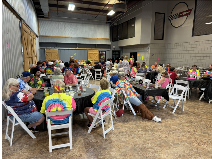
Dinner at the Blast. There was a 70's Hippie theme this year.