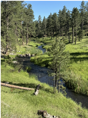
French Creek in Custer State Park, SD