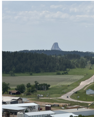
Devil's Tower, WY in the distance