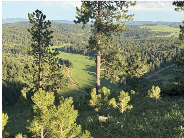
Evening in the Blackhills near Custer, SD