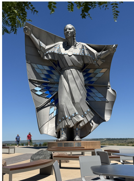
Sculpture named "Dignity" at a rest stop near Chamberlain, SD (notice how small the people behind her look)