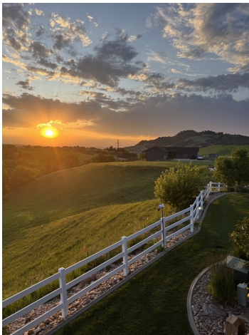
Sunset near Spearfish, SD at our friend's house