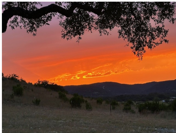
Leakey, TX sunset Scott Knode

I had planned on leaving Saturday the 18th but rain was in the forecast for Texarkana that day and at home the next day so I postponed my departure by a day following the rain instead of riding in it. A cold front had brought the rain in so after spending the night in Texarkana I left at 7:30am with 50 degrees outside. The temperature actually fell to 46 along the way before finally warming up to the mid-60's by the time I reached home at, believe it or not, 4:30.